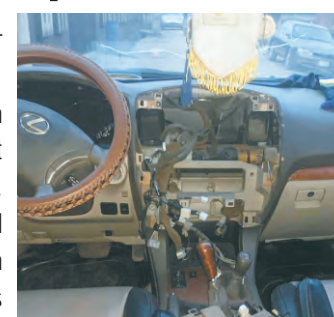
One of the vehicles with stolen