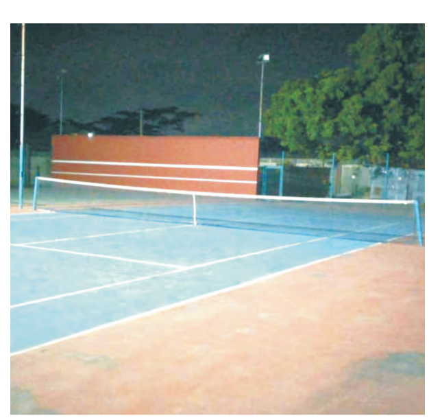
for players who are not able Lawn tennis court at Adejumo lawn tennis club and sport center

"The sport center looks scanty during the week but always filled up at the weekends as members of the club come with their families to play lawn tennis," he explained.