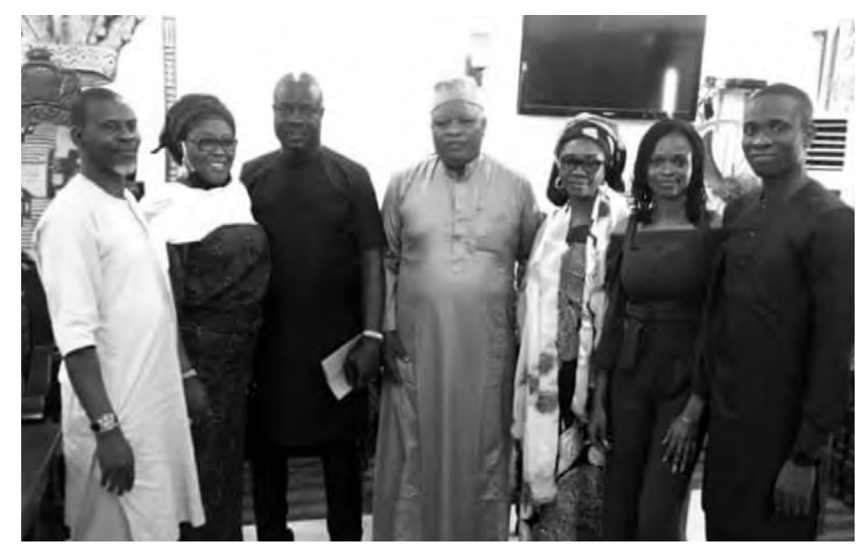
LSDPC Estate executives with HRM Oba Kabiru Agbabiaka during the visit